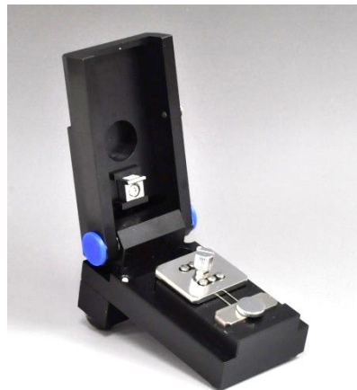
Set guide plate.