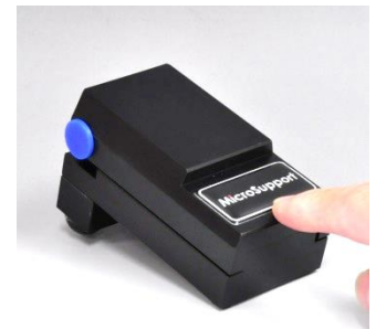
Close cover slowly and press lightly with finger.