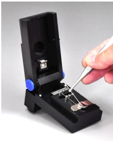
Place one or two tungsten probe in holder.